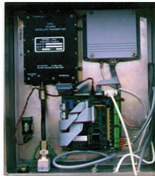
MicroDCP, digital barometer, and satellite transmitter in stainless weatherproof enclosure.

At Mesotech, we offer our customers the total solution for obtaining meteorological, hydrological, and environmental information. Our products and services include precision sensors, automatic weather stations, voice reporting stations, airport weather advisory systems, mesoscale networks, and systems engineering and development services.