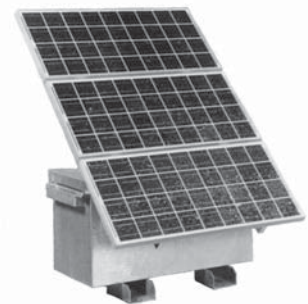
Solar electric generator for sites without an AC power source.