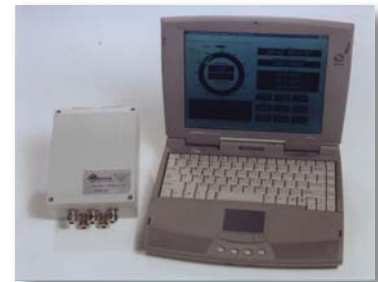
MicroDCP in small, diecast aluminum weatherproof enclosure connected to portable maintenance computer.