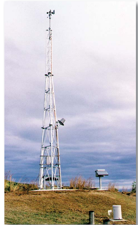
Autonomous SYNOP Station with geostationary satellite transmitter and solar electric power supply.

The SYNOP Station can be ordered with either an AC/DC power supply or a solar electric generator. The AC/DC power supply operates on any international power from 90 to 260 VAC, 50/60 Hz. A battery backup UPS is available. The solar electric generator is a self-contained unit with solar panels, charging regulator, battery, battery shelter, and support structure. Mesotech can assemble a solar subsystem that will service the power required by your station with the energy available at your specific site.